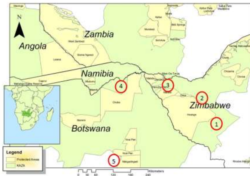
Map of study sites. 1) Tsholotsho 2) Mabale 3) Victoria Falls, Mvuthu/ Shana area 4) Chobe Enclave 5) Khumaga, Makgadikgadi

those headed by women. Poverty increases reliance on natural resources, leading to unsustainable, illegal or commercial utilisation of resources such as wood, wildlife products and bush-meat. Simple improvements to cropping methods greatly improve yields and food security, and reduce land and labour requirements and environmental damage.